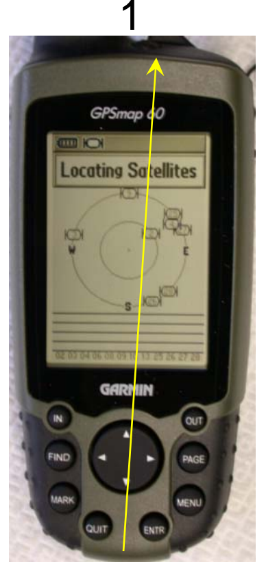
Press <u>ON</u> button and wait for satellites