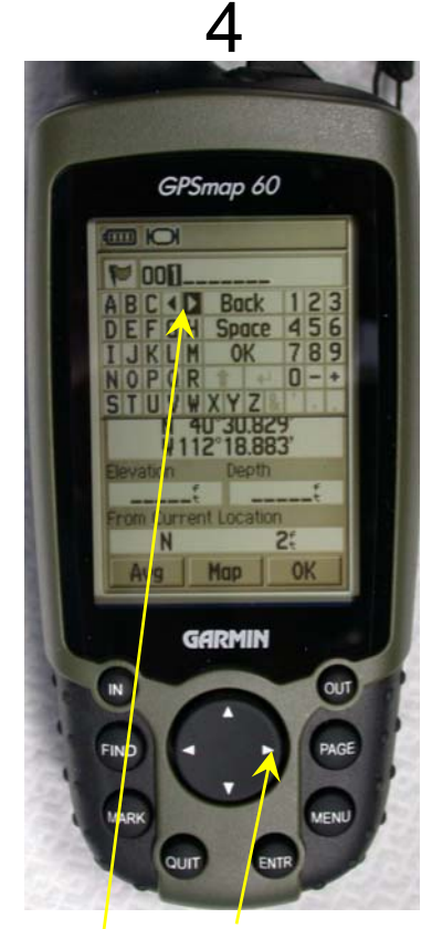
Press <u> Rocker</u> to the right arrow and press <u> Enter </u> until the number to replace is hi-lighted</u>

NOTE: If you get in trouble, Press the Quit button and start over